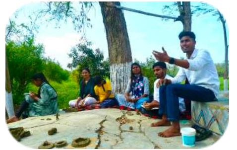
Philosophy and Play meet during an Art1st teacher workshop