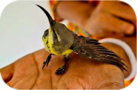
Loka students save a wounded sunbird