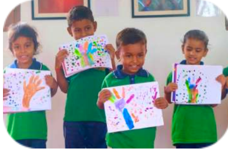
Thursday morning presentation by Loka's smallest ones