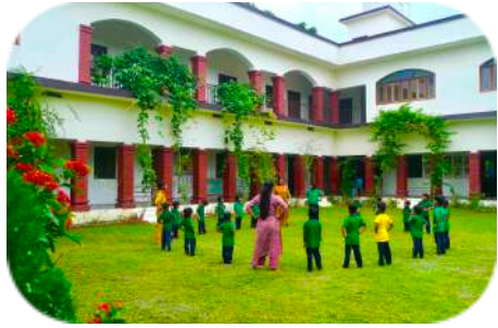
Junior students participate in Body Movement activities