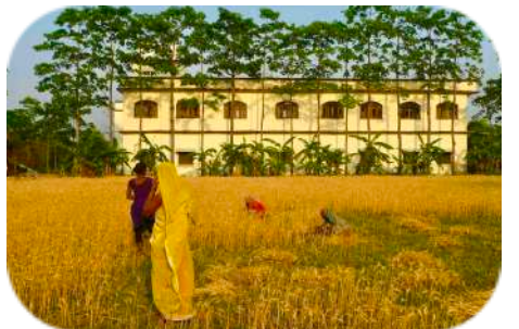
Local village women harvesting wheat on Loka's farm