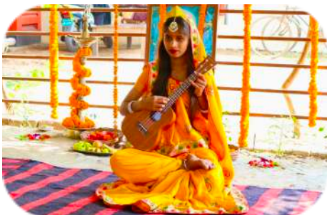
Saraswati Puja: worshipping the Goddess of Culture & Knowledge