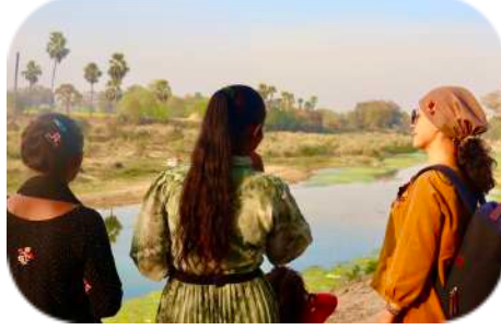
Walking with a Korean visitor along the local Punpun river trail