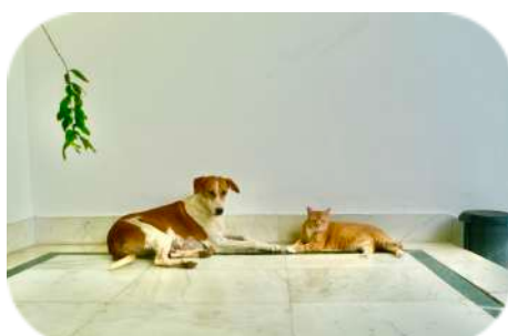
Pure Love: Loka's pets Tara the dog and Bheem the cat